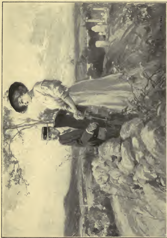
“Leaning on the uneven stones . . . they looked down at the roofs of the village.”